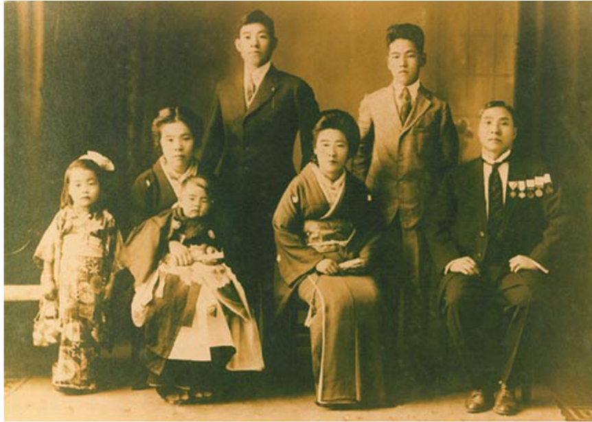
Taken about 1923