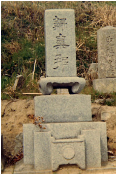
Nuibe Family Grave in Saka-cho, Japan